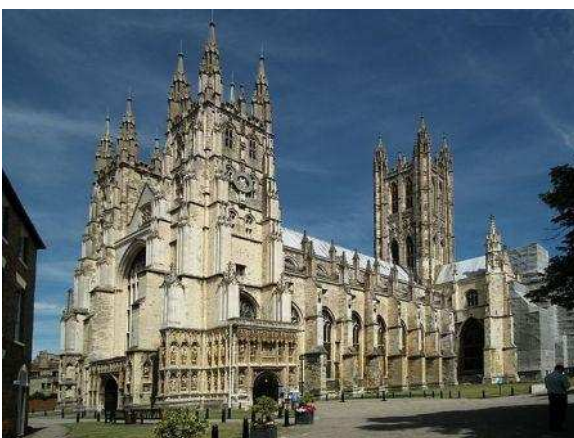
Canterbury Cathedral, Jan. 28, 2012

I am teaching two classes and am helping manage the 19 students we have in the London Studies program. We stay very busy with teaching and then supplementing our experiences by visiting various locations throughout London and beyond. Part of our church activities include attending various services and getting exposed to a wide variety of worship styles. Last week we attended an Anglican service at Westminster Abbey which was beautiful but very formal. This week we will attend a contemporary Anglican service with drums and guitars and an informal speaking style. It reminds me of the many great ways we have to worship God and how God can use many settings to Glorify Him and share His word.