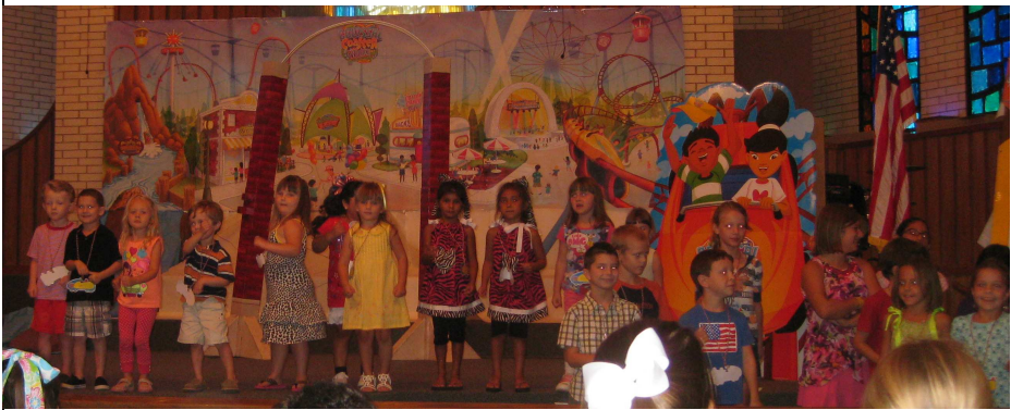
The classes sang for their families on Family Night at our Brady VBS: Colossal Coaster World.

Around 80 children enrolled this year. Seeds were planted and watered at VBS. We will wait on God's will in the harvest.