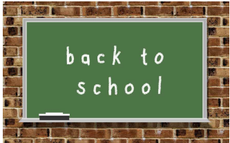
First Day of School August 26

Do nothing out of selfish ambition or vain conceit, but in humility consider others better than yourselves. Philippians 2:3