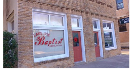
For event reminders, follow us on Facebook: Lake Ivie Baptist Association